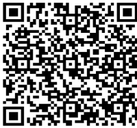
Directions for entering course requests in SchooLinks

Thank you for your careful consideration of courses for your child.