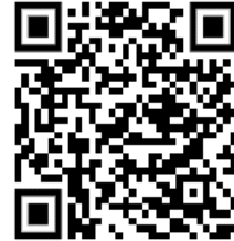
KISD Course catalog - view to read course descriptions